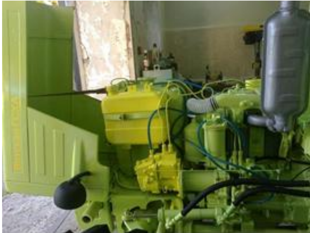
Figure 1. Diesel engine 2H 10.5 / 12.0 power supply system when operating on diesel fuel and methanol with separate feed, mounted on a tractor